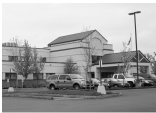
Cordata Parkway @ PeaceHealth Medical Group 4545 Cordata Parkway Lower Level Suite 4