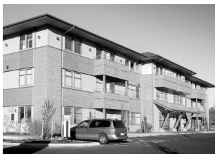
Northwest Avenue 4029 Northwest Avenue, Suite 102