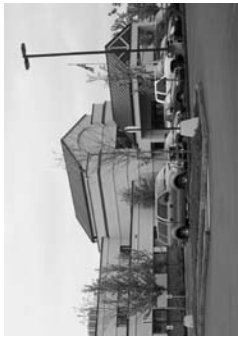
Cordata Parkway 4545 Cordata Parkway Lower Level Suite 4